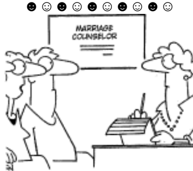
“We were made for each other. I needed new luggage and he came with a lot of baggage.”

W: What would you do if I died? Would you get married again? H: Definitely not! W: Why not – don’t you like being married? H: Of course I do. W: Then why wouldn’t you remarry? H: Okay, I’d get married again. W: You would? (with hurtful look on her face) H: (audible groan) W: Would you sleep with her in our bed? H: Where else would we sleep? W: Would you replace my pictures with hers? H: That would seem like the proper thing to do. W: Would she use my golf clubs? H: No, she’s left-handed. W: (silence) H: Damn.