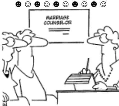
“We were made for each other. I needed new luggage and he came with a lot of baggage.”

W: What would you do if I died? Would you get married again? H: Definitely not! W: Why not – don’t you like being married? H: Of course I do. W: Then why wouldn’t you remarry? H: Okay, I’d get married again. W: You would? (with hurtful look on her face) H: (audible groan) W: Would you sleep with her in our bed? H: Where else would we sleep? W: Would you replace my pictures with hers? H: That would seem like the proper thing to do. W: Would she use my golf clubs? H: No, she’s left-handed. W: (silence) H: Damn.